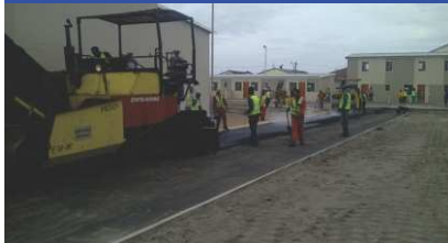
Thembelhille 220 Low Cost Houses, Pelican Park

Site clearance || Bulk earthworks || Sewer reticulation Water reticulation || Storm water infrastructure || Storm water dams House platforms || Roads || Parking