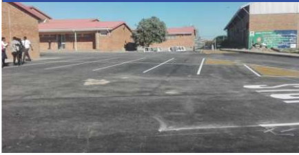
Luhlaza High School, Khayelitsha

Bulk earthworks || Storm water infrastructure || New entrance Roads || Parking areas || Paved walkways