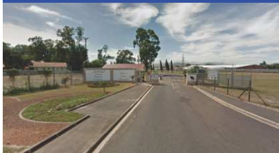
Stikland Hospital, Bellville

Client: PAWC: Department of Health Year Completed: 2011 Value: R 8 000 000