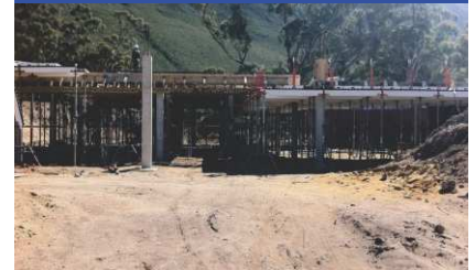
Hermanus Sports Grounds, Hermanus

Client: PAWC: Transport & Public Works Year Completed: 2013 Value: R 1 800 000