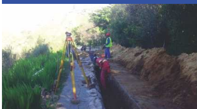
Jonkershoek Nature Reserve, Stellenbosch

Upgrade access road || Sewer reticulation Building renovations