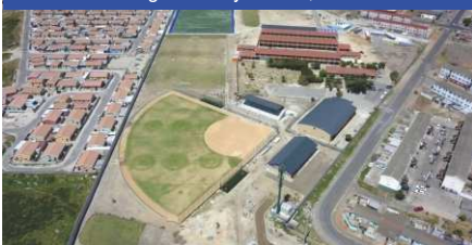
Prince George Primary School, Lavender Hill

Bulk earthworks || Storm water infrastructure || New entrance Roads || Parking areas || Paved walkways