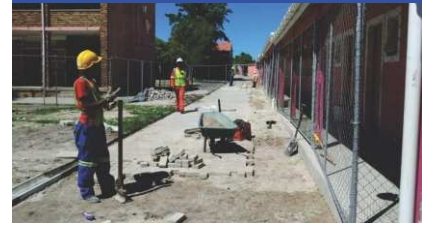
Kathleen Primary School, Grabouw

Water reticulation || Sewer reticulation Storm water infrastructure || Roads || Parking Netball court || Rugby field