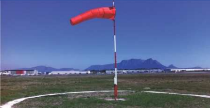
ACSA, Cape Town International Airport