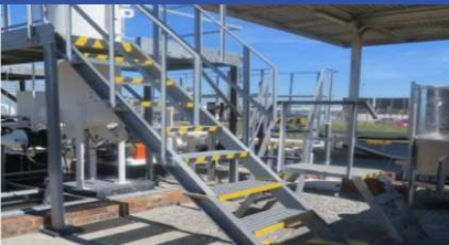
ACSA, Cape Town International Airport

Client: ACSA Year Completed: 2012 Value: R 200 000