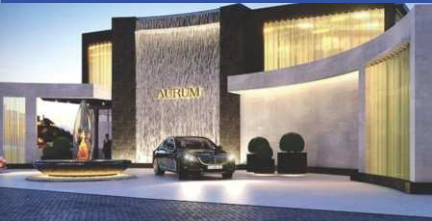
Aurum Presidential and Luxury Suites, Bantry Bay

Access road || Parking areas || Water reticulation Fire reticulation || Paved walkways