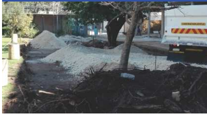
Cape Peninsula University of Technology, Mowbray

New access road || Parking || Sewer reticulation Water reticulation