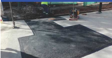
Huis Steyn, Stellenbosch