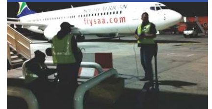
ACSA, Cape Town International Airport

Steel barriers to protect passenger air bridges