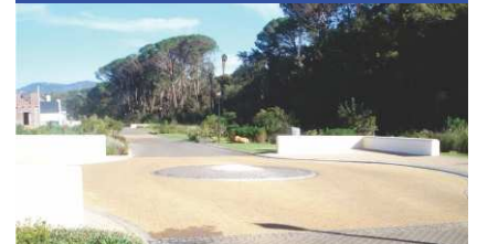
Brandwacht aan Rivier Residential Estate, Stellenbosch

Traffic circles || Gabion retaining walls in river