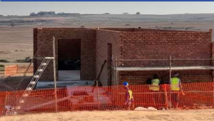
De Hoop Substation, Malmesbury

Earthworks || Platform || Stormwater protection Installation of earthgrid || Building of Substation