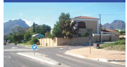
Webersvallei Street Jamestown, Stellenbosch

Upgrades to intersections by introducing traffic circles Widening intersections