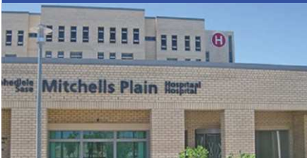
Mitchell's Plain District Hospital, Mitchell's Plain