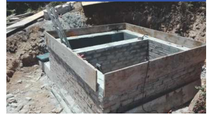
Durbanville Hills Wine Farm, Durbanville

Sewer pump station || Sewer reticulation