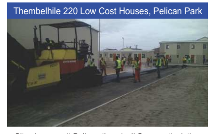
Site clearance || Bulk earthworks || Sewer reticulation Water reticulation || Storm water infrastructure || Storm water dams House platforms || Roads || Parking

Client: DA'REALTY Year Completed: 2019 Value: R 3 500 000