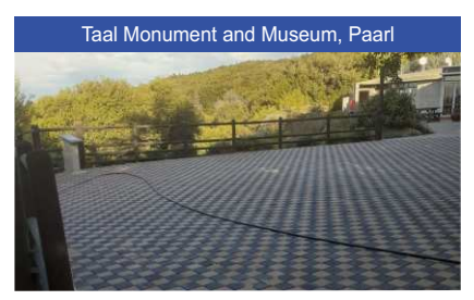
Earthworks || Paving at Monument

Client: Cape Nature Year Completed: 2020 Value: R 1 150 000