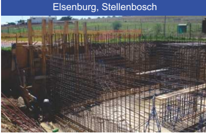
Upgrade of Waste Water Treatment Plan

Client: Babylonstoren (Pty) Ltd Year Completed: 2017 Value: R 3 000 000