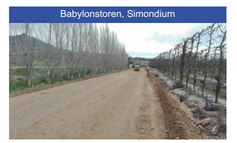
Access roads at plum orchards Storm water infrastructure to protect plum orchards

Client: Babylonstoren (Pty) Ltd Year Completed: 2017 Value: R 3 000 000