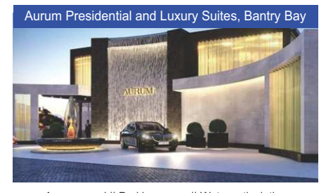
Access road || Parking areas || Water reticulation Fire reticulation || Paved walkways

Client: ACSA Year Completed: 2012 Value: R 200 000