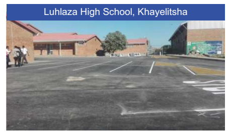
Bulk earthworks || Storm water infrastructure || New entrance Roads || Parking areas || Paved walkways

Client: PAWC: Department of Education Year Completed: 2018 Value: R 3 500 000